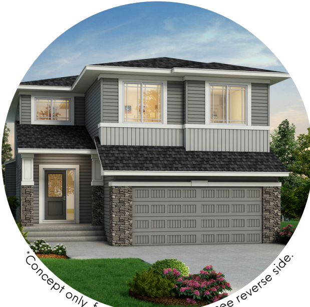
*Concept only, for specific elevation see reverse side.