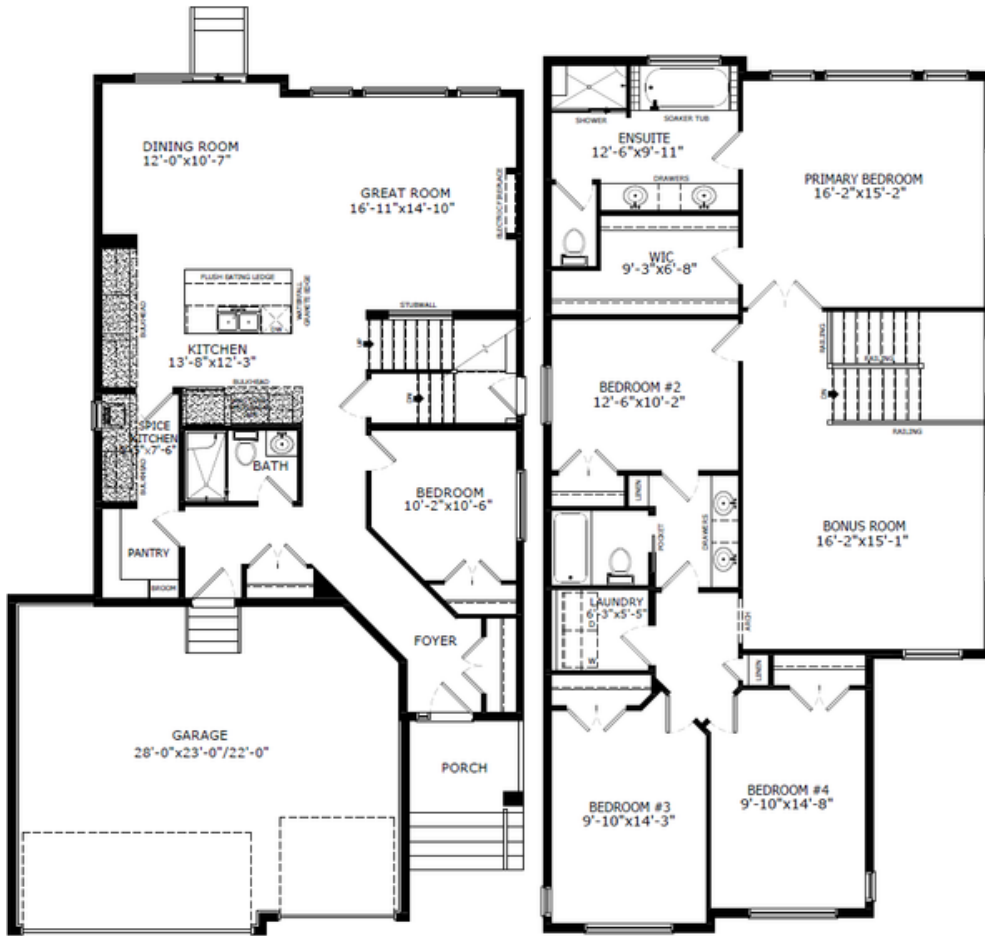
Main Level: 1171 sq. ft.