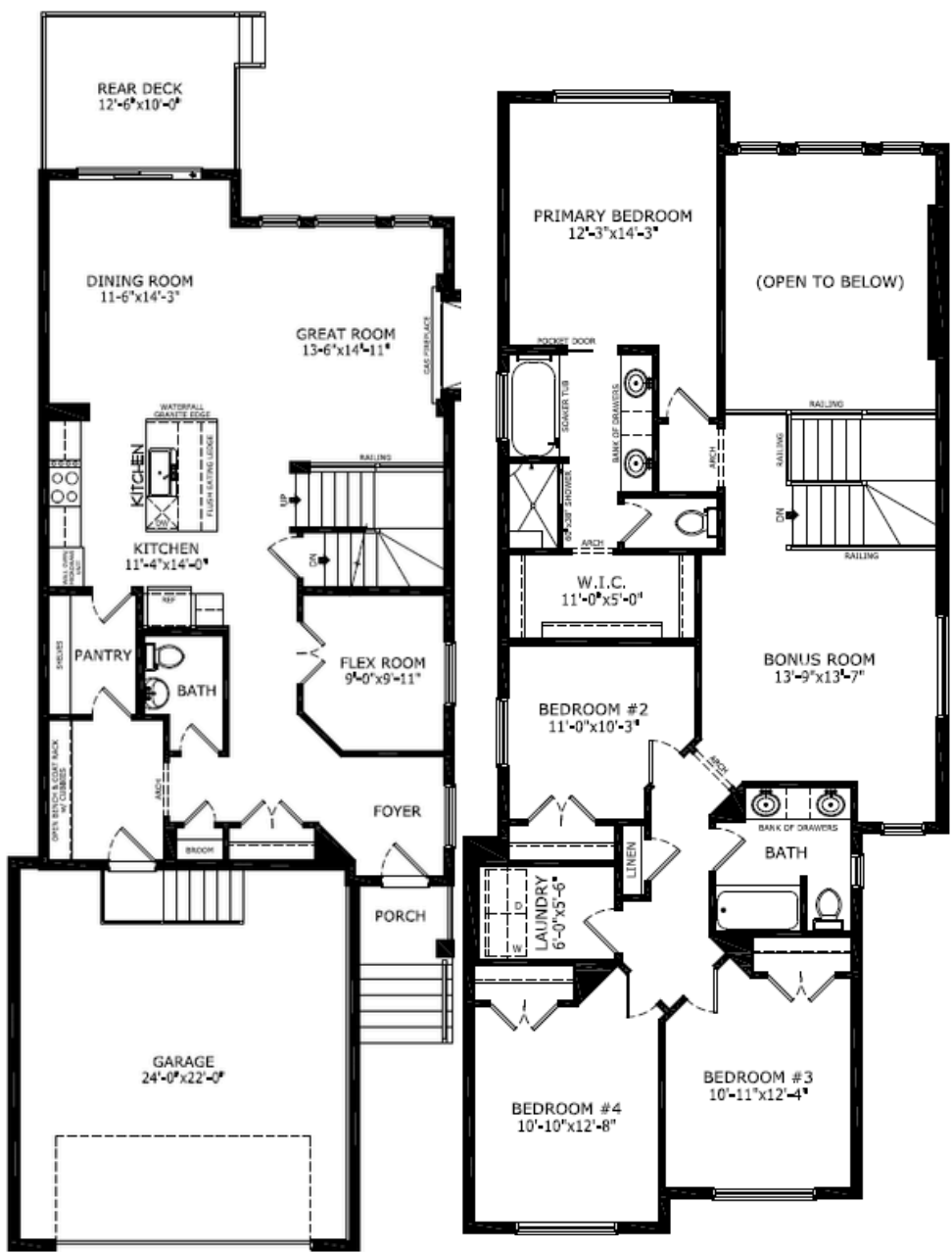
Main Level: 1110 sq. ft.