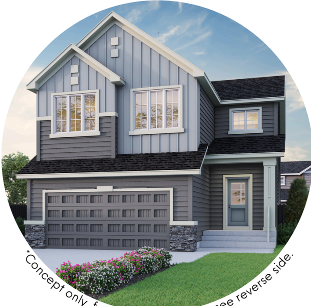
*Concept only, for specific elevation see reverse side.