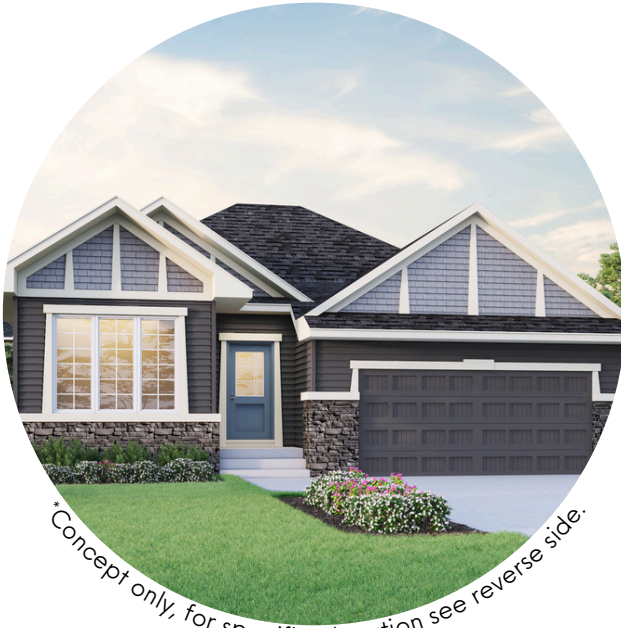
*Concept only, for specific elevation see reverse side.