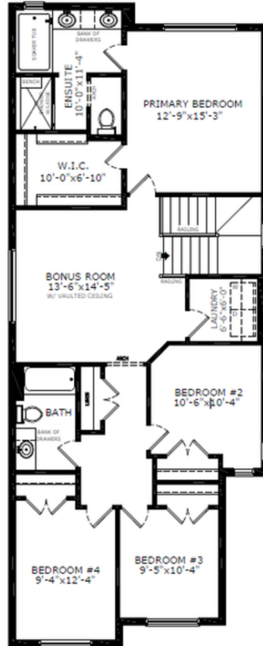
Upper Level: 1333 sq. ft.