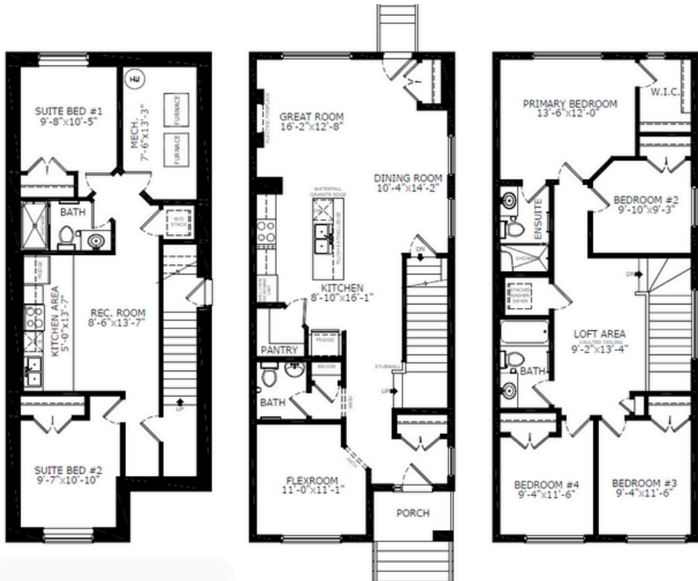
Main Level: 920 sq. ft.