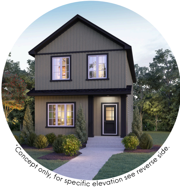
*Concept only, for specific elevation see reverse side.