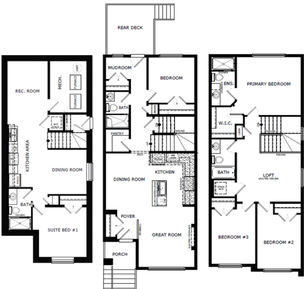
Basement: 639 sq. ft. Main Level: 878 sq. ft. Upper Level: 911 sq. ft.