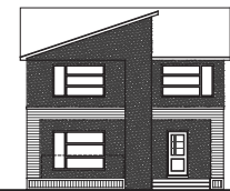
CONTEMPORARY STUCCO ELEVATION